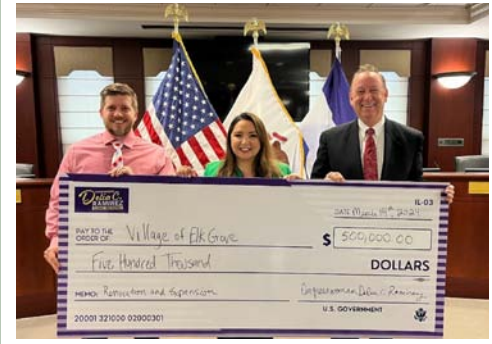
The Village thanks Congresswoman Delia Ramirez, who secured $500,000 in grant funding from the U.S. DOT Highway Improvement Program for the Tonne Road Reconstruction project.

The Village's efforts have been greatly supported by Federal, State, and Local elected representatives as they have helped secure over $8 million in funding to address and support local needs including service delivery and infrastructure projects over the past few years. We express deep gratitude to the supporting agencies and representatives for their assistance.