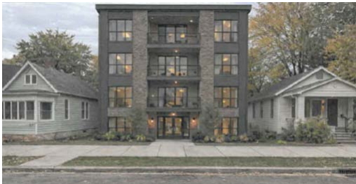
Single family home replaced by 8-unit condo building

The BUILD proposal is intended to increase the housing supply, but in practice it replaces the local regulations that have shaped our neighborhoods with new one-size-fits-all rules from Springfield. Below are some examples of what you could see in your neighborhood if this legislation moves forward.