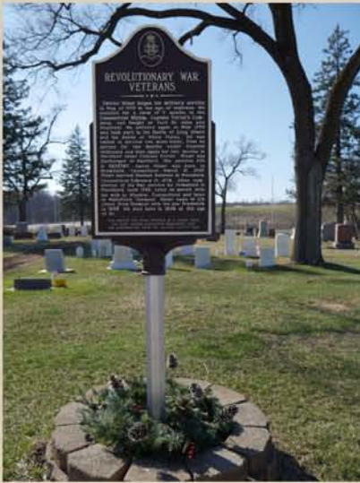
Sign honoring the Revolutionary War veterans buried at the Elk Grove Cemetery.

The Elk Grove Cemetery was formally established by a cemetery association in 1866, although many burials preceded this. The cemetery is located on property originally owned by Frederick W. Miner according to the 1861 plat map of Elk Grove Township.