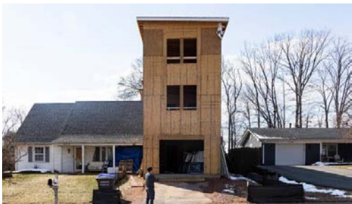
Large addition to existing home to allow additional dwelling units

The BUILD proposal is still under review. If you have concerns, now is the time to contact your State Representative and Senator.