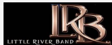
Chart topping hits... "Reminiscing", "Lady", "Cool Change", "Lonesome Loser", "The Night Owls", "Take It Easy On Me", "Help Is On Its Way", "Happy Anniversary", "We Two", "Man On Your Mind", "The Other Guy", and "It's A Long Way There"

Tuesday, July 12 at 7:30 p.m. - Village Green