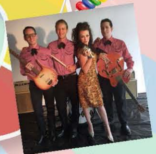
Rosie & The Rivets