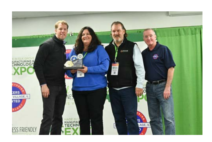
Excellence in Community Support Acme Industries