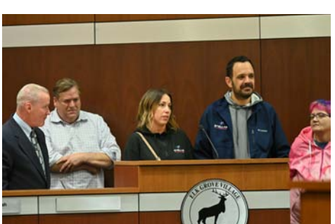
Best Theme: Stellar Plumbing

At the Village Board meeting on October 25, winners from the 2022 Hometown Parade "Falling into Oktoberfest" were presented with their awards. Thank you to everyone who participated for your creativity and enthusiasm!