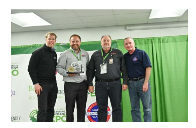
Excellence in Innovation Broetje Automation - USA