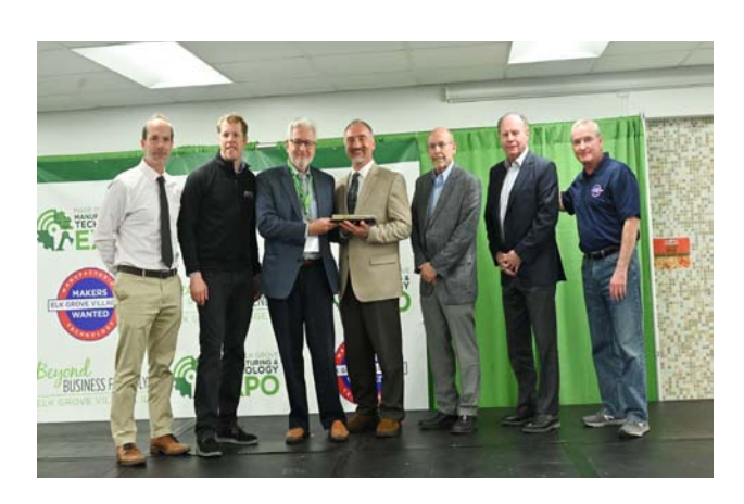
Industrial Development of the Year Steiner Electric